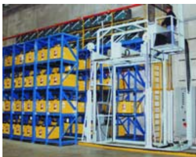
Quad stacking Centurion Hydra-Handler

For more information on our complete line of Hydra-Handlers click here or contact Sackett Systems, your battery management partner, at sales@sackett-systems.com