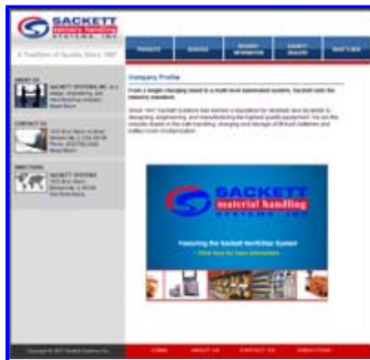
The Home Page of Sackett Systems' new website

For more information on our line of advanced battery handling systems, visit www.sackett-systems.com